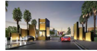
1. COMMUNITY GATE